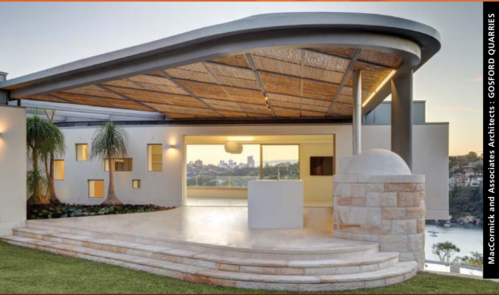
MacCormick and Associates Architects : GOSFORD QUARRIES