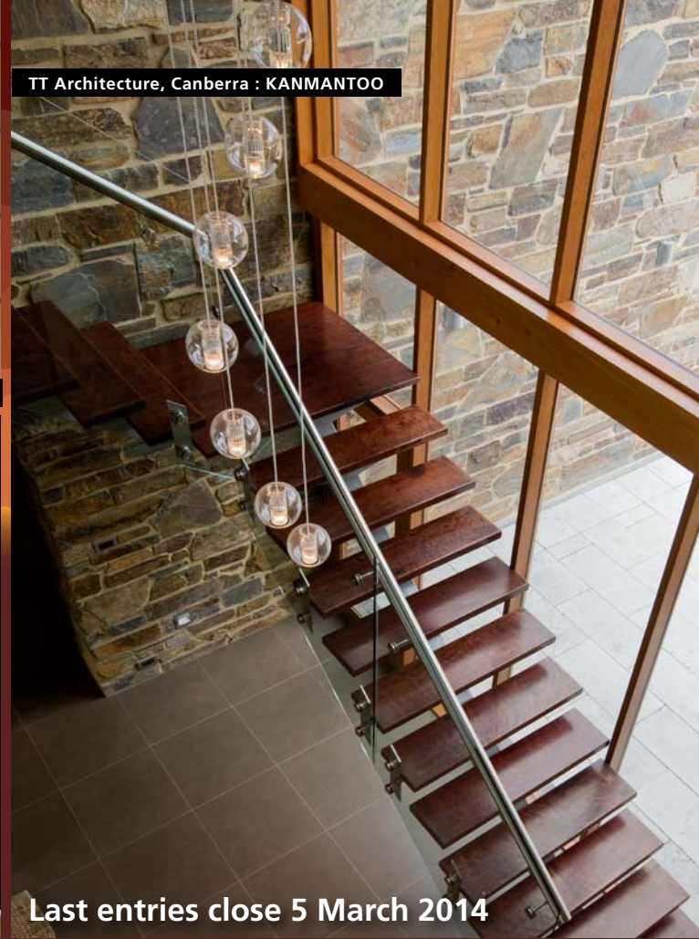
TT Architecture, Canberra : KANMANTOO