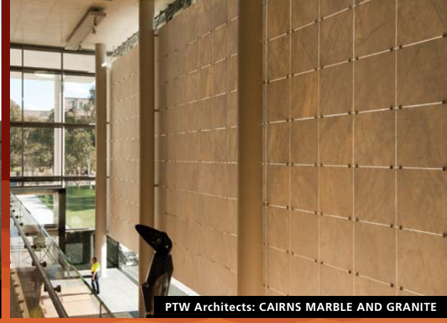
PTW Architects: CAIRNS MARBLE AND GRANITE